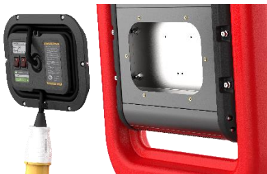
Quick access panel on rear for maintenance