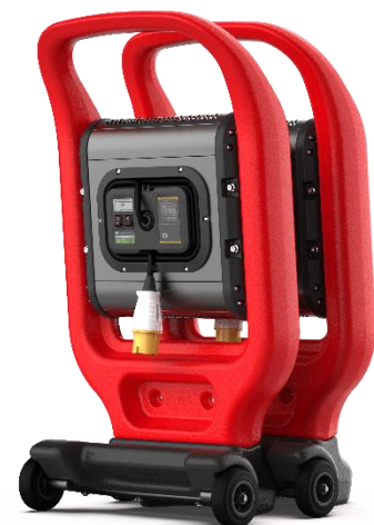
Nesting, space saving design