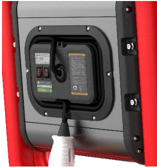
Cable management system

Robust blow moulded construction for durability in the hire sector. Nesting design for space saving whilst off hire. Using the SK15 lamp lamps with a 250mm pre-wired ends. Internal bi axis safety switch for increased protection. Lightweight and manoeuvrable design for ease of use.